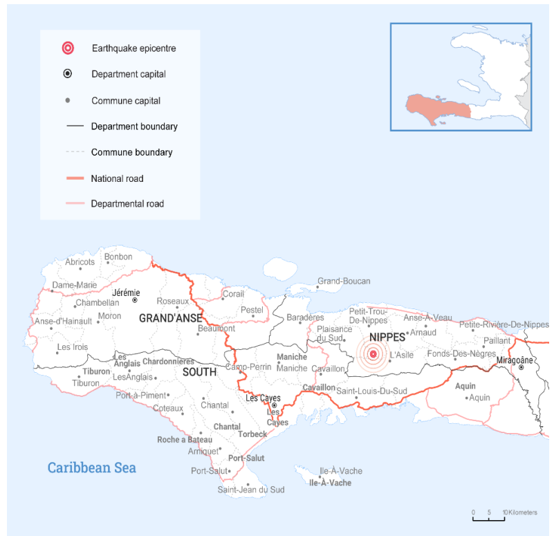
The boundaries and names shown and the designations used on this map do not imply official endorsement or acceptance by the United Nations. Creation date: 15 Aug 2021 Sources: CNIGS Feedback: ocha.haiti.im@gmail.com | www.unocha.org www.reliefweb.int | www.reliefweb.int